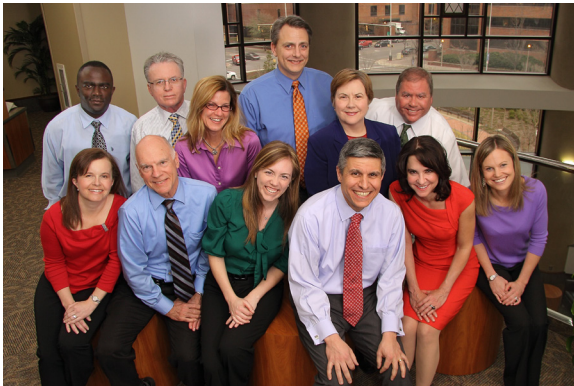
UAB Maternal-Fetal Medicine Physicians

Choosing world-class pregnancy care from UAB's maternal-fetal specialists is the first important decision you'll make in the life of your child. Why? Because 10 to 20 percent of women do not know their pregnancy is high-risk until labor, and 12 percent of deliveries are premature. By selecting UAB, you will receive women's care listed among America's best by U.S. News & World Report . You will also benefit from an obstetric and gynecology department consistently ranked among the top five in the country in the amount of research and training grant support awarded by the National Institutes of Health. That means you will receive care from nationally recognized experts in obstetrics—UAB physicians who stand ready to provide the highest level of care for your pregnancy.